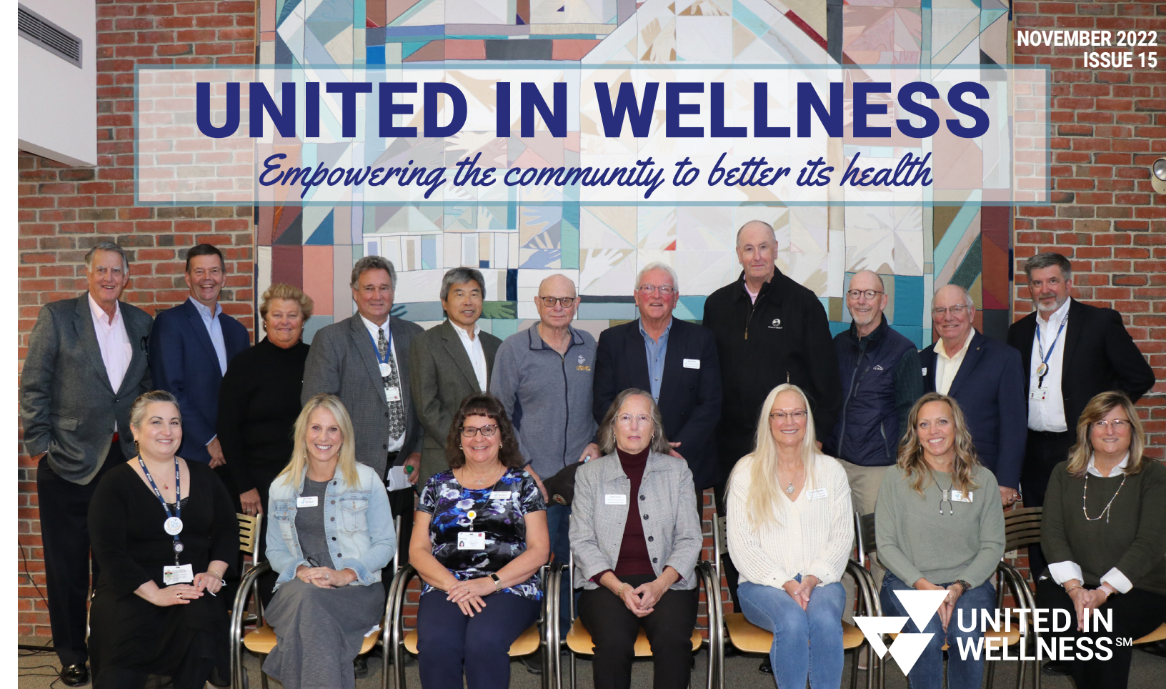
The Together We Can Campaign Cabinet, United in Wellness Leadership Advisory Board and staff at a recent tour of Exeter Hospital's Michael and Jeanne Falzone Center for Cancer Care.

Our newsletter will soon be coming to you by email!