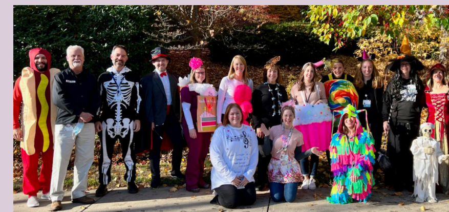
The Radiation Oncology team had a birthday theme for their costumes this year.