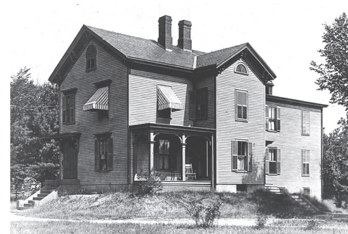
Celebrating 125 years of caring for our community

Our newsletter will soon be coming to you by email!