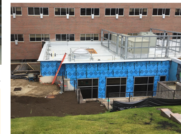
The addition to the Center is taking shape. This new space will house our larger infusion bays with windows that look onto tiered gardens.

There are still some naming opportunities available. For more information, email advancement@ehr.org or call 603-580-6668.