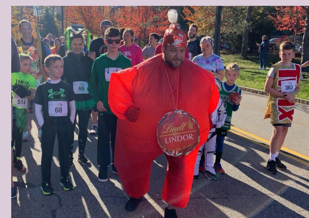
"And they're off!" More than 560 people participated in this year's event, many dressed in costumes for the spirit of Halloween.

There are still some naming opportunities available. For more information, email advancement@ehr.org or call 603-580-6668.