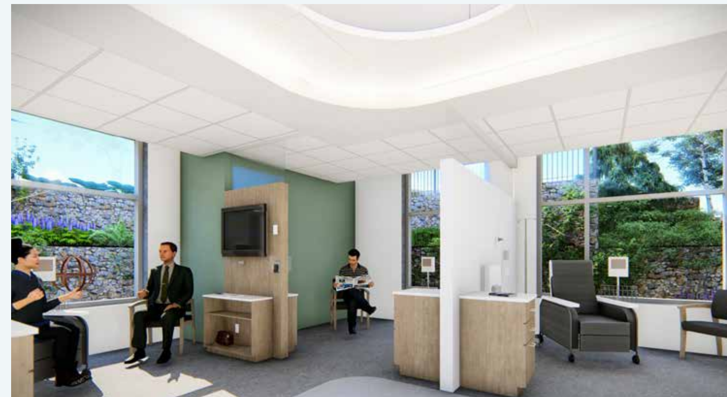
Rendering of future infusion bay area